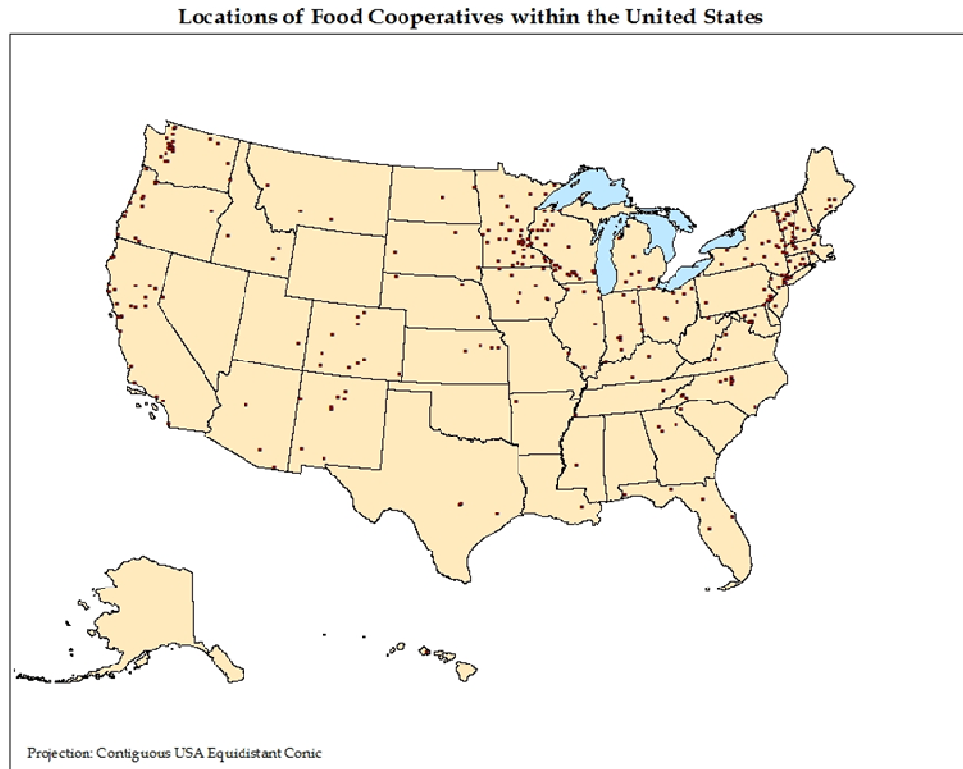
Figure 1. Location of Food Cooperatives within the United States (created by author).